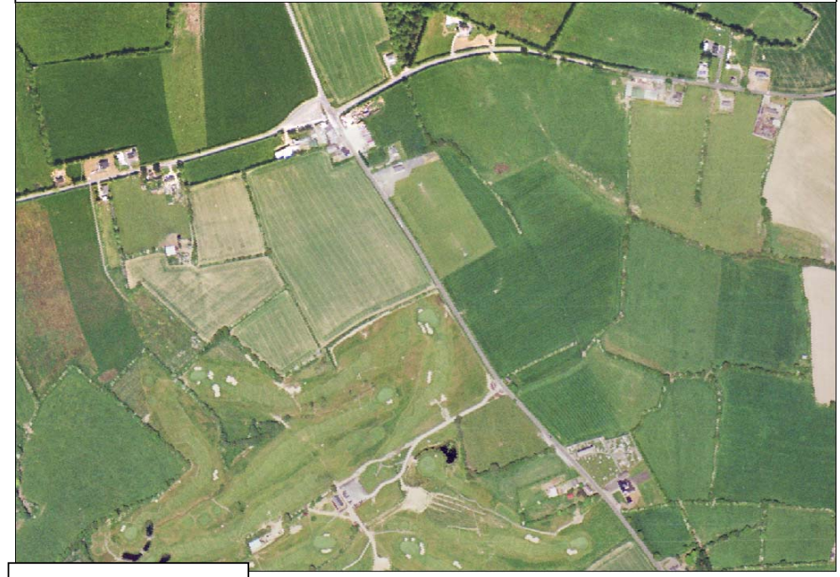
Map No. 1